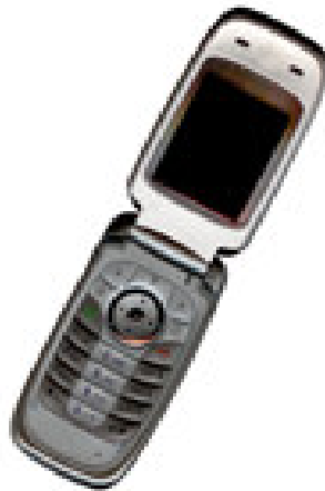
Fig. 2 Example of an unacceptable low-resolution image

Figures must be numbered using Arabic numerals. Figure captions must be in 8 pt Regular font. Captions of a single line (e.g. Fig. 2) must be centered whereas multi-line captions must be justified (e.g. Fig. 1). Captions with figure numbers must be placed after their associated figures, as shown in Fig. 1.