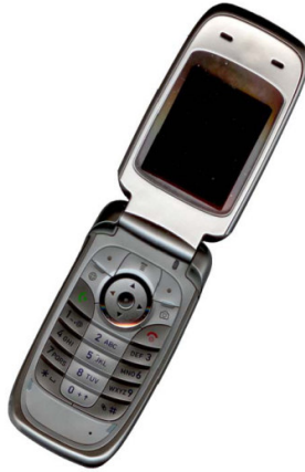
Fig. 3 Example of an image with acceptable resolution